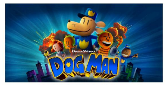
Taylor Park School Gym Doors Open 5:30pm | Movie Start: 6pm

Free event - Donations are welcome! Bring a pillow or blanket for comfort. Popcorn & juice boxes sold on site - cash only